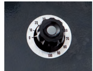
With speed control