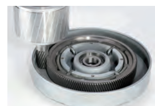
Metal Gear drive