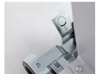
Mechanical brake system