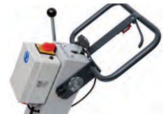
Quick drum lower/lifting